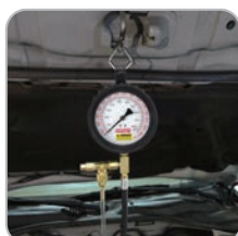
The Uniquely Designed Pressure Relief Valve