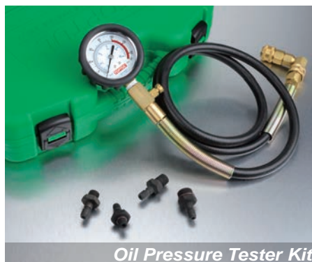
Oil Pressure Tester Kit