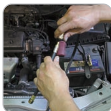
The Quick Coupling System