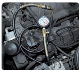
2-1/2" Diameter Gauge (150 PSI / 10 BAR) with Relief Valve, 51" Hose with Quick Coupler